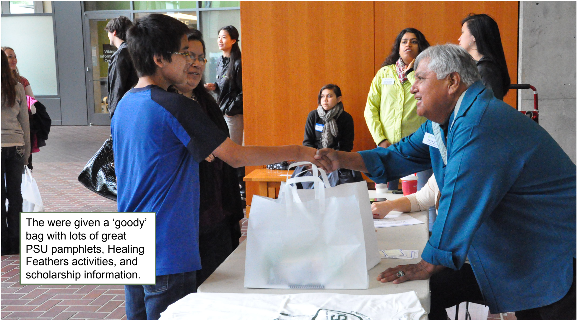
The were given a 'goody' bag with lots of great PSU pamphlets, Healing Feathers activities, and scholarship information.